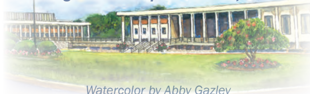
Watercolor by Abby Gazley

ECAA is dedicated to perpetuating the legacy of the Living Memorial to Dwight D. Eisenhower as proposed by unanimous decision of the 90th Congress on September 17, 1968.