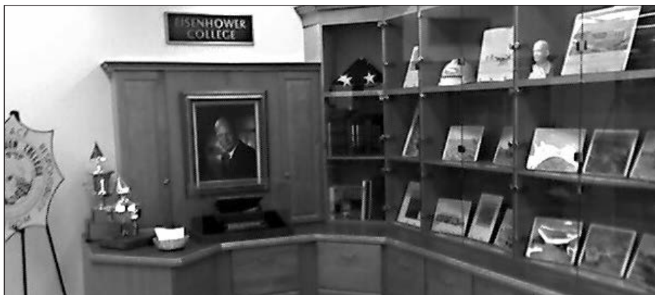
A view of the ECAA archives during Homecoming 2006.

Be sure to check our website often— www.eisenhowercollege.org —for Homecoming 2007 details.